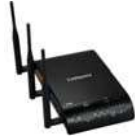
CradlePoint MBR1400 Router